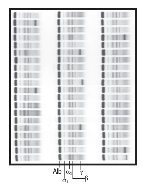
Figure 1: A SPIFE Split Beta SPE-60 Gel showing relative position of the bands.

Figure 1 illustrates the electrophoretic mobilities of the albumin, alpha<sub>1</sub>, alpha<sub>2</sub>, beta and gamma protein bands on a SPIFE Split Beta SPE Gel. The fastest moving band, and normally the most prominent, is the albumin band found closest to the anodic edge of the gel. The faint band next to this is alpha<sub>1</sub>, followed by alpha<sub>2</sub> globulin, split beta and gamma globulins.