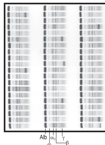
Figure 1: A SPIFE Split Beta SPE-60 Gel showing relative position of the bands.

Figure 1 illustrates the electrophoretic mobilities of the albumin, alpha 1 , alpha 2 , beta and gamma protein bands on a SPIFE Split Beta SPE Gel. The fastest moving band, and normally the most prominent, is the albumin band found closest to the anodic edge of the gel. The faint band next to this is alpha 1 , followed by alpha 2 globulin, split beta and gamma globulins.