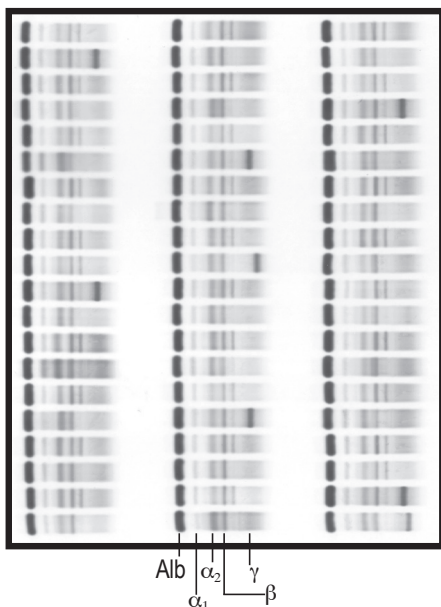
Figure 1: A SPIFE Split Beta SPE-60 Gel showing relative position of the bands.

Figure 1 illustrates the electrophoretic mobilities of the albumin, alpha 1 , alpha 2 , beta and gamma protein bands on a SPIFE Split Beta SPE Gel. The fastest moving band, and normally the most prominent, is the albumin band found closest to the anodic edge of the gel. The faint band next to this is alpha 1 , followed by alpha 2 globulin, split beta and gamma globulins.